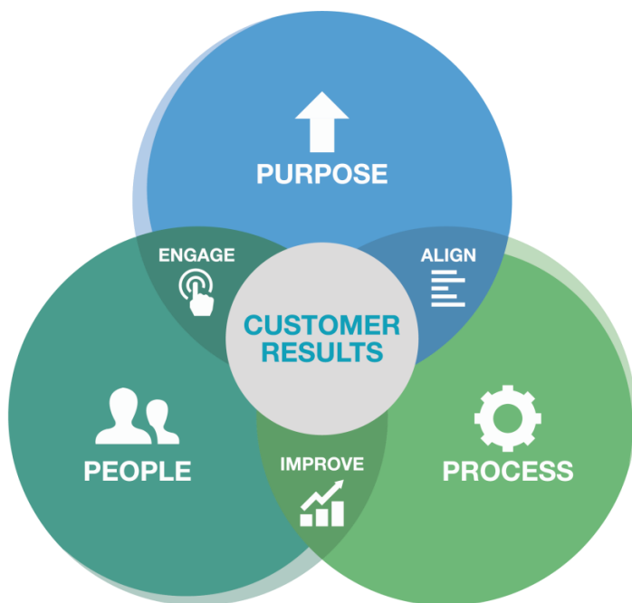
The S A Partners Enterprise Excellence Model ®