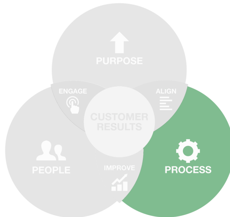
The S A Partners Enterprise Excellence Model ®

Organisations often approach what they do by taking what they did last year and improving it by 5% thereby capping potential improvement.